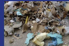
OUTPUT INDUSTRIAL WASTE