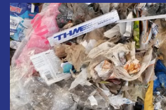
INPUT INDUSTRIAL WASTE